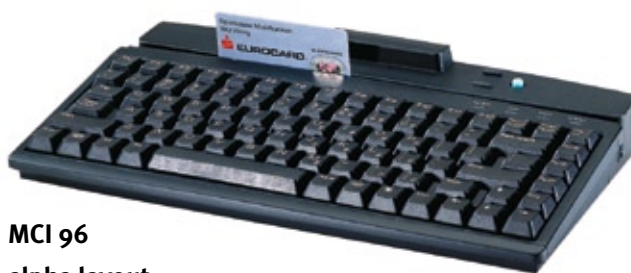
MCI 96 alpha layout