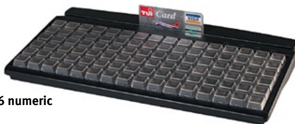
MCI 96 numeric layout